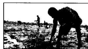
Need land for food? Buy or lease from Pakistan